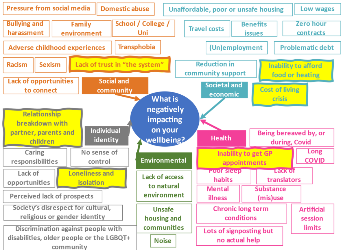
Slide 1 – Issues raised by Kent and Medway Listens as impacting on people's wellbeing

5.18 The slide below summarises the wide range of issues highlighted by the listening programme. Issues highlighted in yellow came up most frequently.